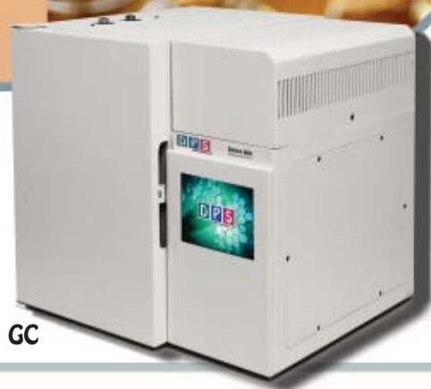
Series 600 GC