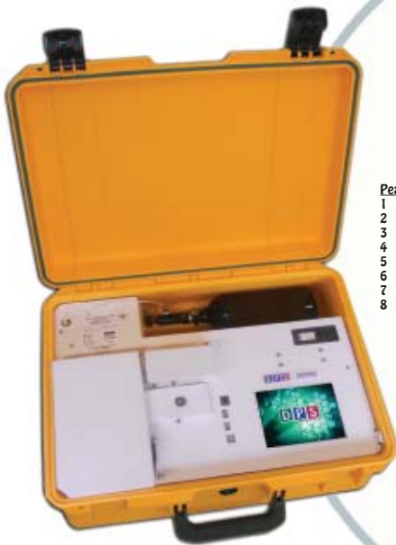
Companion 1 Portable GC