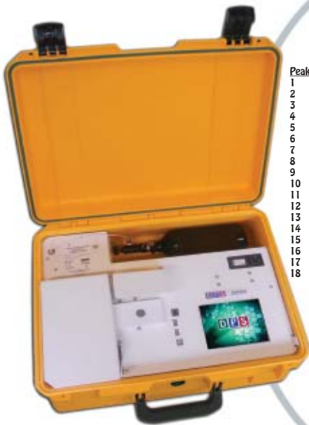
Companion 1 Portable GC