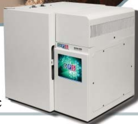
Series 600 GC