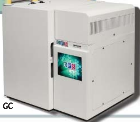
Series 600 GC

500-C-091 - Companion 1 Portable Hydrocarbon Gases GC Analyzer (FID, Valve, 30m)