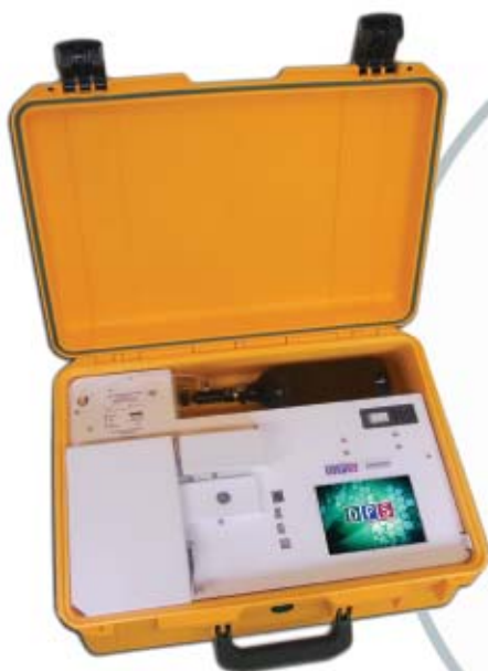
Companion 1 Portable GC