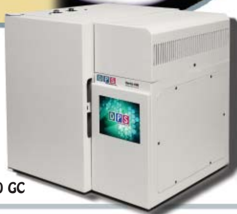
Series 600 GC