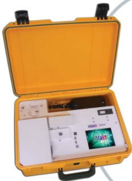
Companion 1 Portable GC